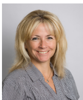
The "EdGate Advantage is YOUR Advantage"